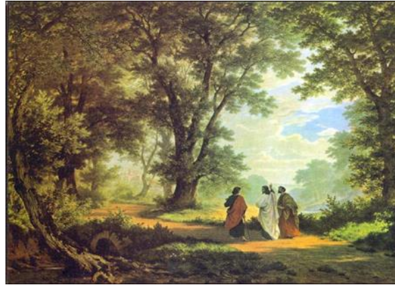
Gang nach Emmaus by Robert Zünd