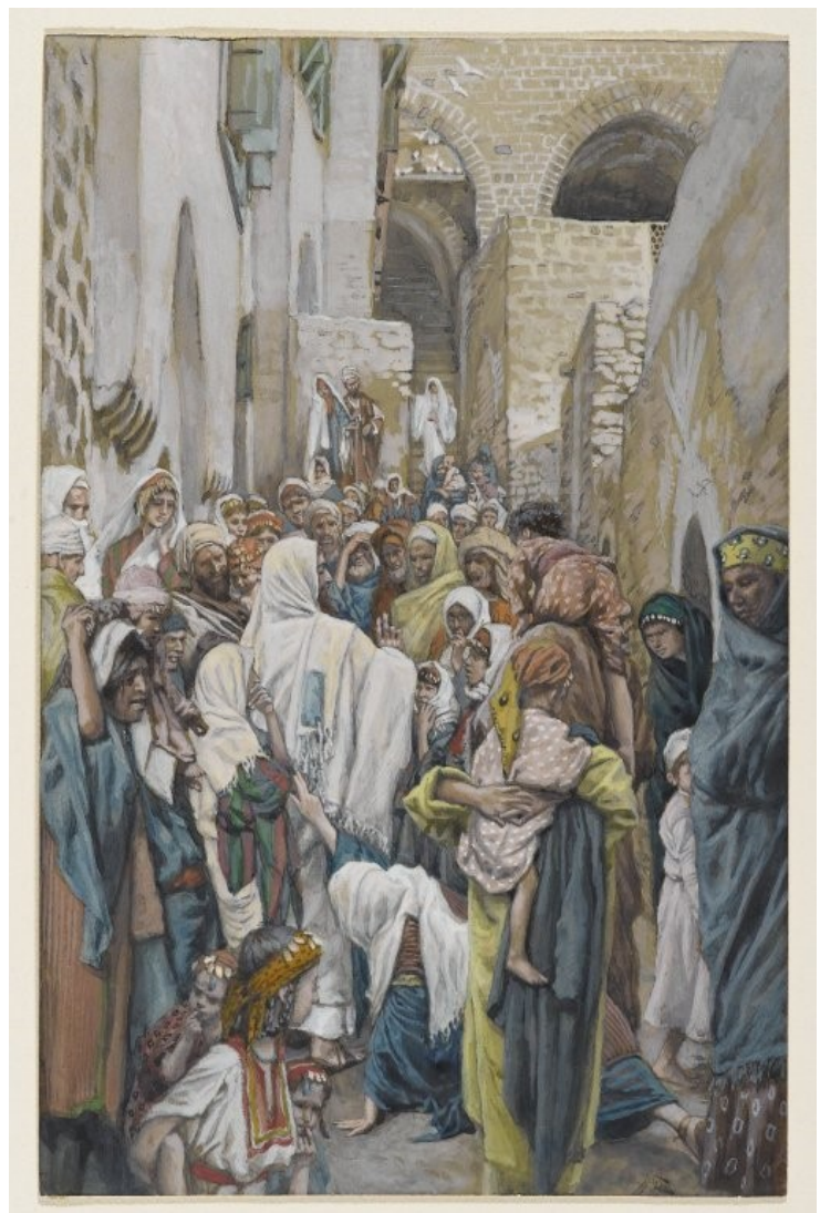
"L'hémorroïsse" by Jacques Tissot