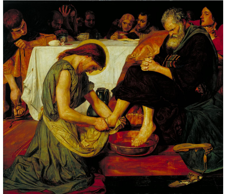
"Jesus Washing Peter's Feet" by Ford Madox Brown

In the first reading, Joshua and the tribes of Israel state their fidelity to the Lord God. In his Letter to the Ephesians, Saint Paul draws a parallel between a spousal relationship and the radical love between Christ and the Church. In the Gospel, Jesus proclaims that his words are Spirit and life , after which only some of his followers continued as disciples.