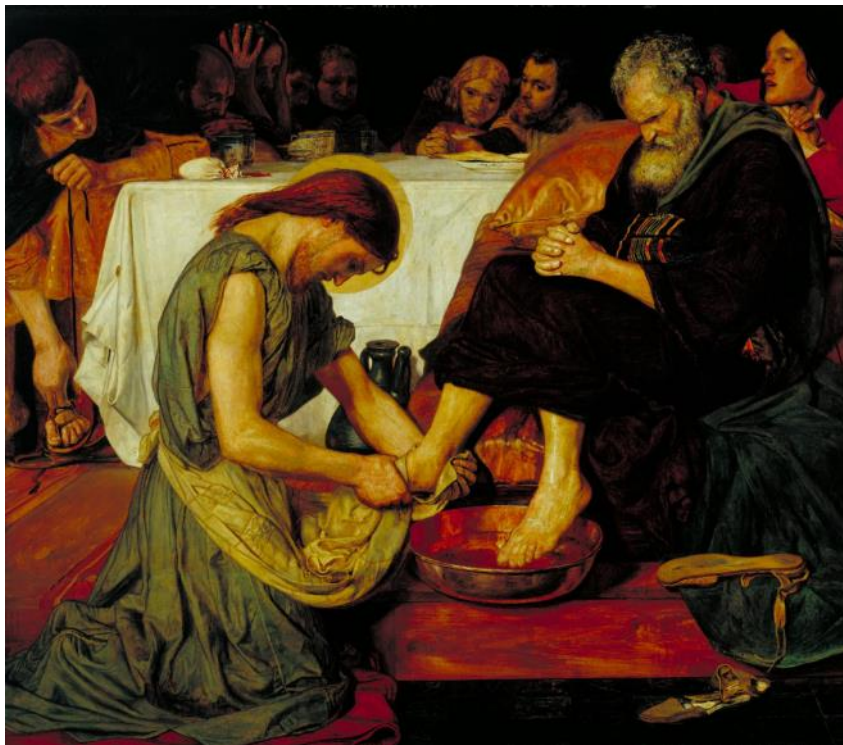
"Jesus Washing Peter's Feet" by Ford Maddox Brown

Facebook Page: https://www.facebook.com/StMarysCoonValley