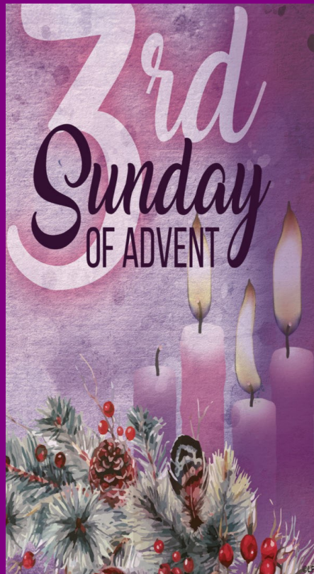
"Mary, the Burning Bush"

Facebook: www.facebook.com/StMarysCoonValley