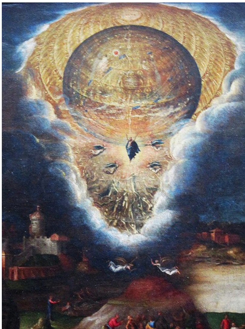
"Mysteries of the Passion, Resurrection, and Ascension of Christ" by Antonio Campi