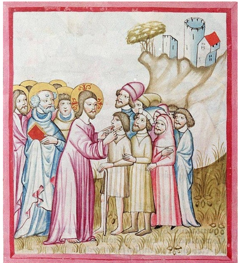
Jesus Christ healing the man who was deaf and dumb, Cura surdo mudo, miniature, folio 86 of the Codex Palatinus Vindobonensis 485 (4th or 5th century), Austrian National Library, Vienna.

Facebook: www.facebook.com/StMarysCoonValley