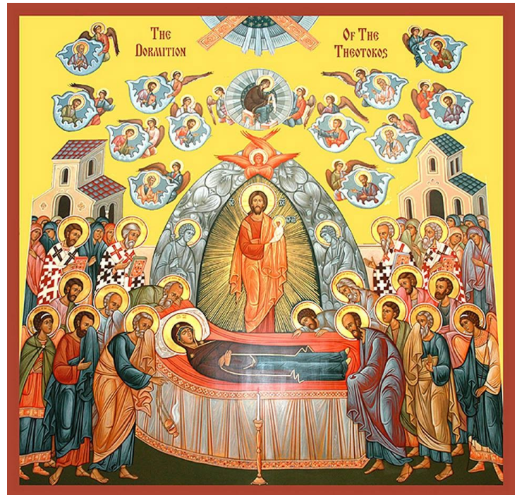
"The Dormition of the Theotokos"

John's vision from Revelation tells of a great sign, a woman clothed with the sun and the dragon who stood ready to devour her child. God protected both mother and son. In the second reading, Paul encourages the Corinthians: as Christ has destroyed death, so through his resurrection, his believers, will be brought to life at the proper time. In the Gospel, Mary travels to visit Elizabeth. When Mary greets her, the infant in Elizabeth's womb leaped for joy .