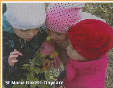
St Maria Goretti Daycare