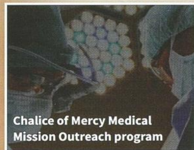
Chalice of Mercy Medical Mission Outreach program

Chalice of Mercy is a Catholic mission to Ukraine since 2007.