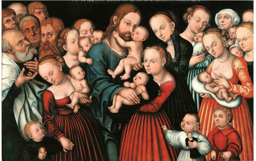
"Christ Blessing the Children" by Lucas Cranach

Facebook: www.facebook.com/StMarysCoonValley