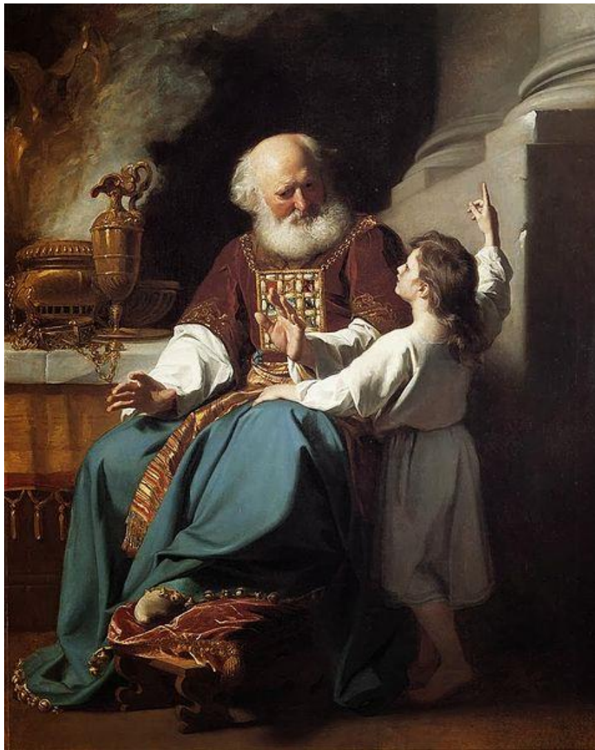
Samuel Relating to Eli the Judgements of God upon Eli's House by John Singleton Copley

Facebook Page: https://www.facebook.com/StMarysCoonValley